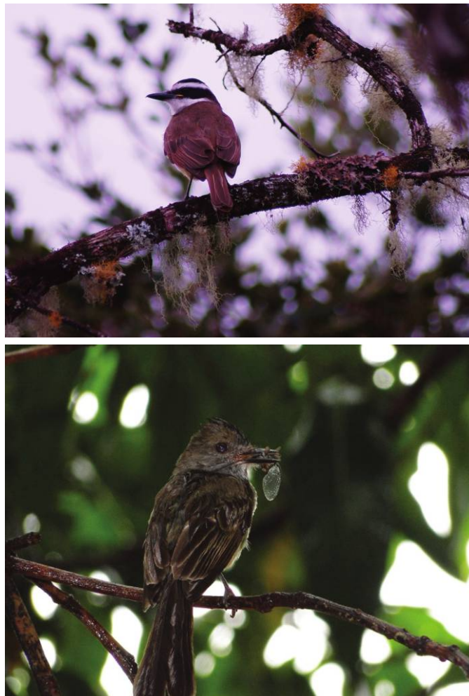
Top, the great kiskadee ( Pitangus sulphuratus ) foraging in the restinga. Bottom, Myiarchus swainsoni (Tyrannidae) perched after catching an insect in a coastal forest.