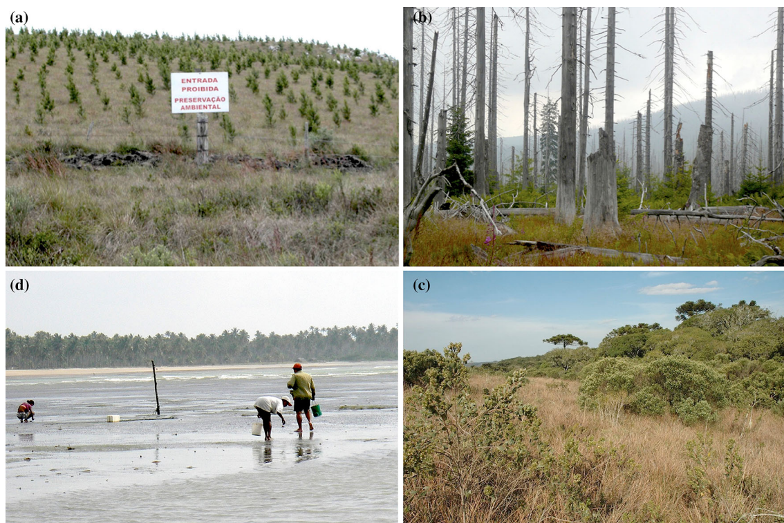
Fig. 1 Examples of environmental issues that professionals of different fields have to address in their work (clockwise from top left). a Afforestation of extensive areas in south Brazil, often with exotic trees, has been advocated by the cellulose industry and unsoundly justified as “restoration of deforested areas” that in fact are natural grassland—an indication of lacking ecological knowledge by the professionals involved. The sign reads “Entrance forbidden—environmental preservation.” b Forest dieback caused by bark beetle outbreaks in the Bavarian Forest National Park (SE Germany). Contrary to general understanding, research demonstrated that such outbreaks do favor regeneration of spruce, the species mainly affected by bark beetle, showing that decisions of practitioners need to be informed by current ecological research. c Exclusion of human interference may be an ineffective strategy for biodiversity conservation if ecological processes are not understood. The depicted species-rich subtropical grasslands in the South Brazilian highlands need periodic fire or grazing to maintain their biodiversity; otherwise, succession to shrubland and forest takes place. d Clamshell diggers, as well as traditional fishers, are losing ground to beach houses, tourism, and industrial fishing in the coast of NE Brazil. Combined conservation of natural resources, traditional livelihoods, economic, and demographic growth is hard to achieve in fragile coastal ecosystems and requires interdisciplinary work

One aspect of ecological literacy has been largely overlooked despite its evident strategic importance. In our view, it is especially important to enhance literacy of a wide spectrum of professionals whose day-to-day work touches on environmental issues (Fig. 1). The inadequate ecological literacy among those who should apply ecological science to environmental problems as part of their professional activities points to a specific impediment that needs to be addressed by academic ecologists at universities: the gap between current ecological research as practiced, and the way ecology is presented in university courses for various careers. Here we discuss how this gap arises, and propose ways to promote effective acquisition of the knowledge needed across this broad range of future professional activities.